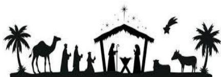
Loreto 2023 Christmas Card